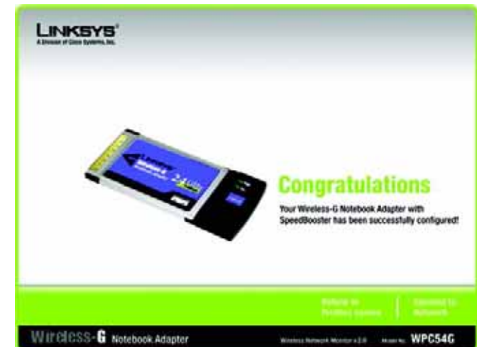
Figure 6-31: The Congratulations Screen

You have successfully created a connection profile.